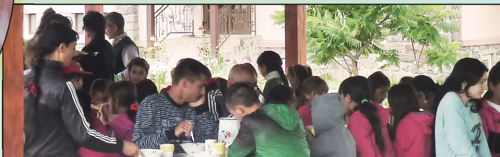
Roma mission center in Csonkapapi/Carpath-Ukraine