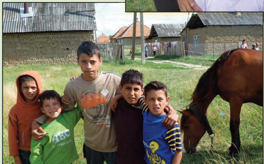
Roma community, village of Botragy in Carpath-Ukraine.