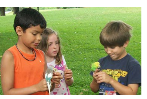
USA Mission Experience