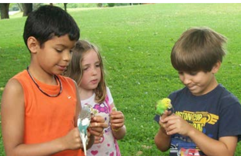
USA Mission Experience