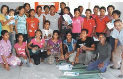
Fellowship of the Least Coin