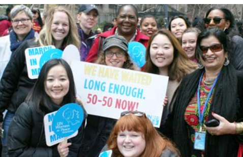
Commission on the Status of Women