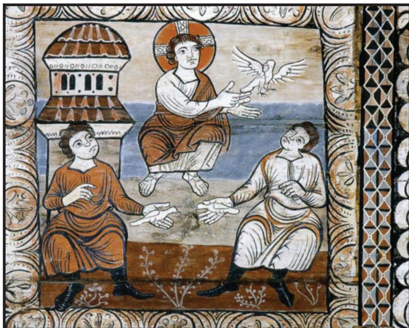
Jesus Gives Life to Birds , artist unknown, 1120, Church of St. Martin, Zillis, Switzerland