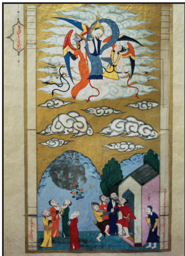
The Ascension of Christ , Seyyid Loqman Ashuri, 1583, Ottoman Empire, Turkey

The four canonical Gospels (Matthew, Mark, Luke, and John) are not the only Gospels written by early Christians. Other stories about Jesus circulated in the early centuries of Christianity, offering us stories of the “missing years” of Jesus and, more importantly, information about the diversity of early Christianity.