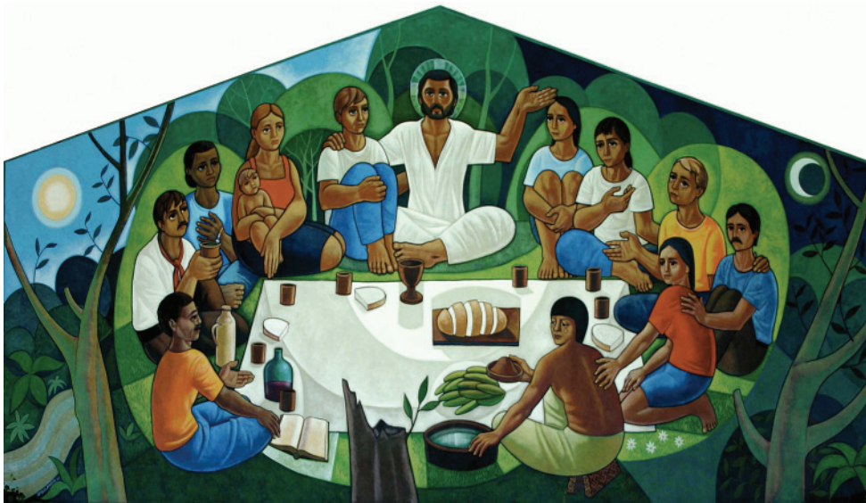
En la Cena ecológica del Reino (The Ecological Supper of the Kin-dom) by Maximino Cerezo Barredo, 1980, Spain