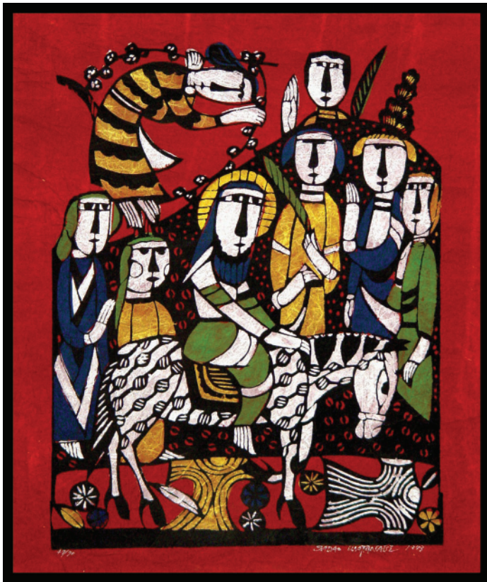
The Triumphal Entry by Sadao Watanabe, 1974, Japan