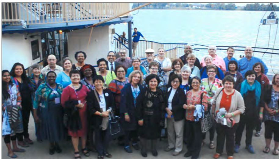
PW staff and the International Committee of Fellowship of the Least Coin celebrated together on an Ohio River dinner cruise Wednesday evening, October 19, 2016.