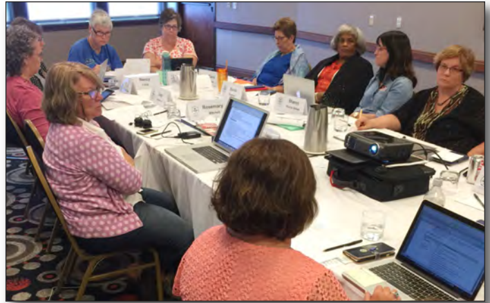
Members of the Communications and Funds Development Committee consider options for additional funding.

that this position begin as a part-time position, which will require adjustments to the job description.