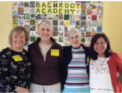
PW of San José, children's literacy