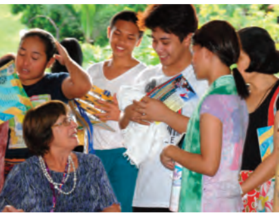
Fellowship of the Least Coin