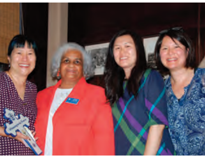
USA Mission Experience