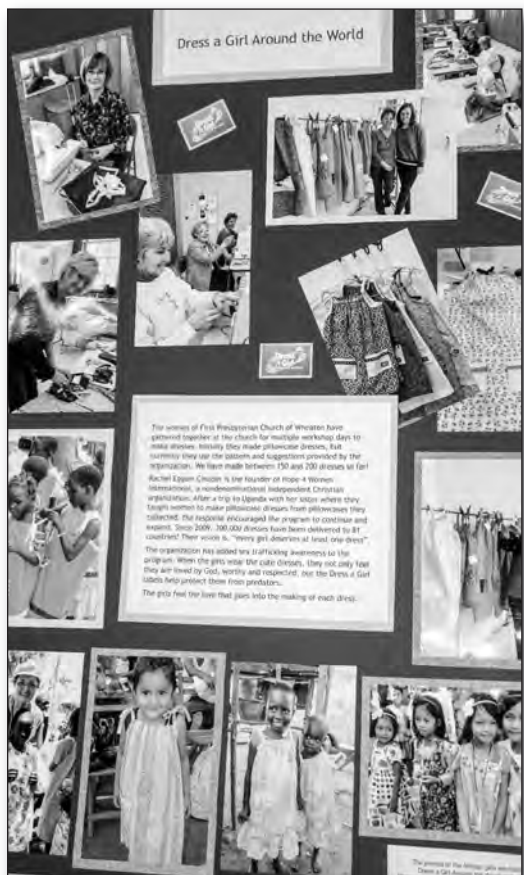
The women of First Presbyterian Church of Wheaton, Illinois, have gathered together at the church for multiple workshop days to make dresses for Dress a Girl Around the World, a nondenominational, independent Christian organization.

I'd love to hear your story. Write me: winksmama@gmail.com .