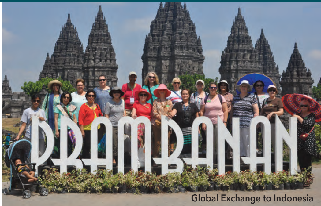
Global Exchange to Indonesia

During this experience, "I felt a connection to the one God—who is worshipped in so many different ways and places—and to others seeking the divine."