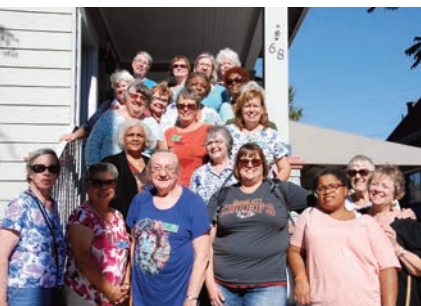
USA Mission Experience