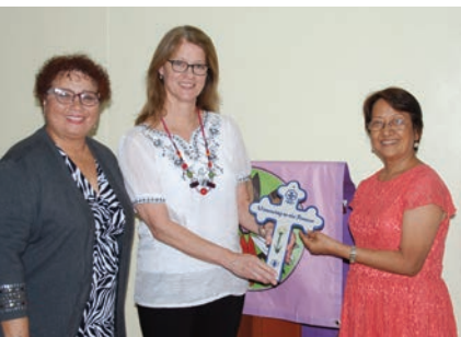
Fellowship of the Least Coin