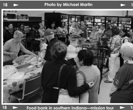
Food bank in southern Indiana—mission tour