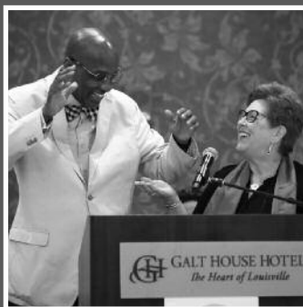
2 Stated Clerk receives HLM