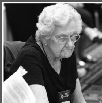
3 Voting representative