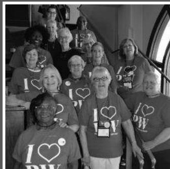
19 PW from Detroit Presbyterian 19