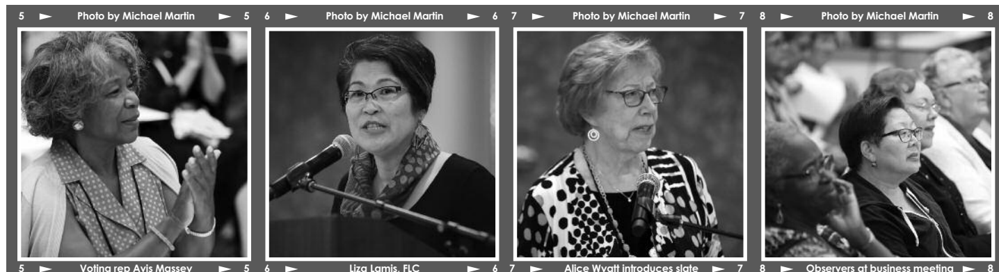
5 5

The other change to the bylaws states that a director, having served a term, is not eligible to serve another term until at least three years have passed.