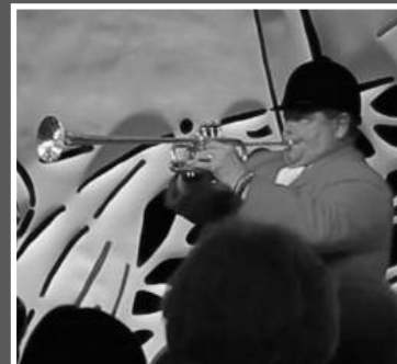
21 The call to post 21