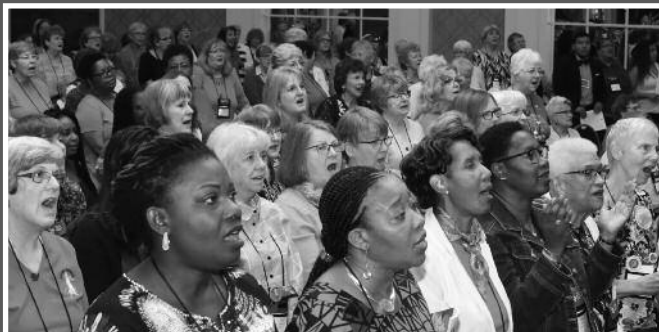
20 Plenary 20