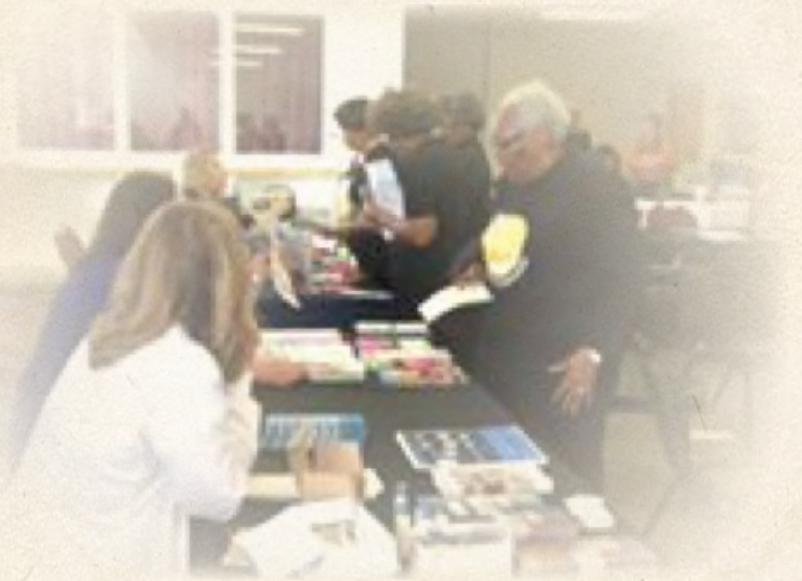
Cancer Association of Anderson, Food for Thought