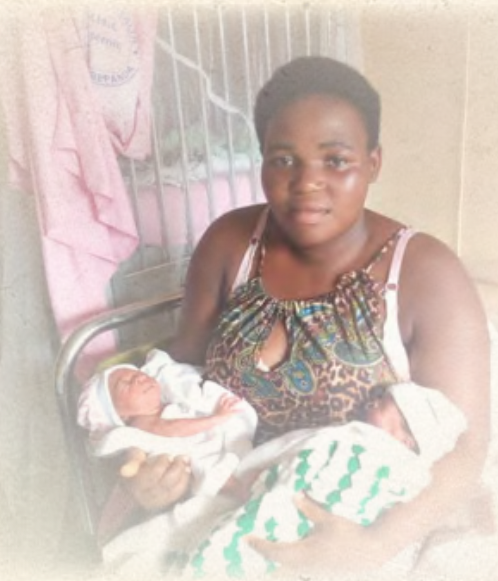
Cameroon; Making Blood Available for Transfusion in Obstetric Units