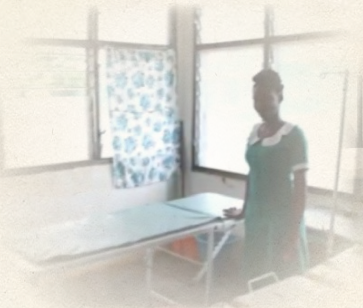
Ghana and Synod of the Northeast; Ghana Maternity Ward Partnership