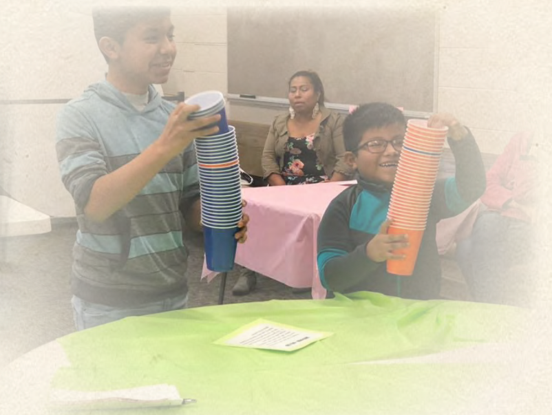
Iowa WINS, Immigrant Neighbors in Need