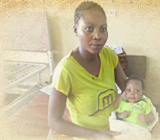
Democratic Republic of Congo, Well for PAX Clinic

PAX is a medical center for women that operates under a collaborative mission between the Congo Presbyterian Church and the Congo Mennonite Church. To reduce the scarcity of drinkable water for the center, the Thank Offering will fund a drill-hole well. Pregnant women and newborns, as well as the surrounding populations, will benefit from the prevention of waterborne diseases, improved hospital hygiene and the saved cost of buying water.