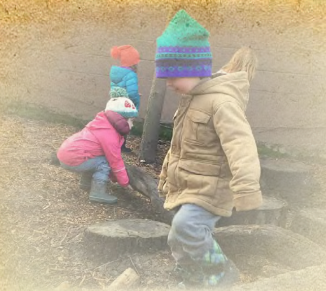
Kenilworth Community Preschool, Outlast Outdoor Block Set