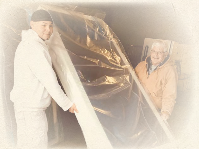
Firelands Presbyterian Church, Now I Lay Me Down to Sleep