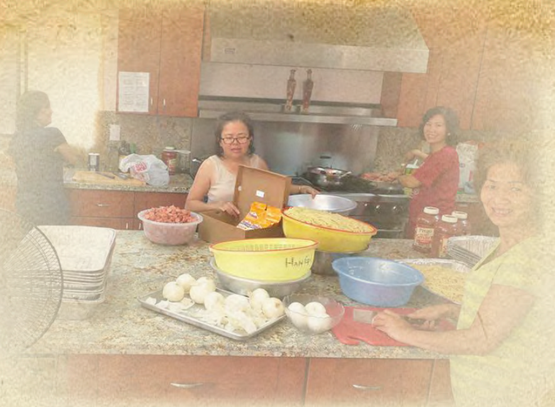
Agape Fish Fund, Food as Medicine

Outlast Blocks. Made for durable use, the blocks will extend learning to the outdoor classroom, with child-directed, open-ended activities that encourage cooperation, language building, large muscle development, and experimentation with mathematical and scientific principles.