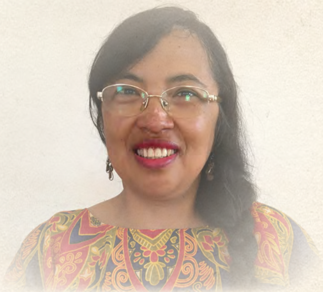
Madagascar; Mamonjy Project