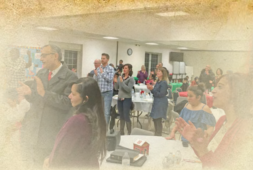
Arab Christian Fellowship, Walking Together