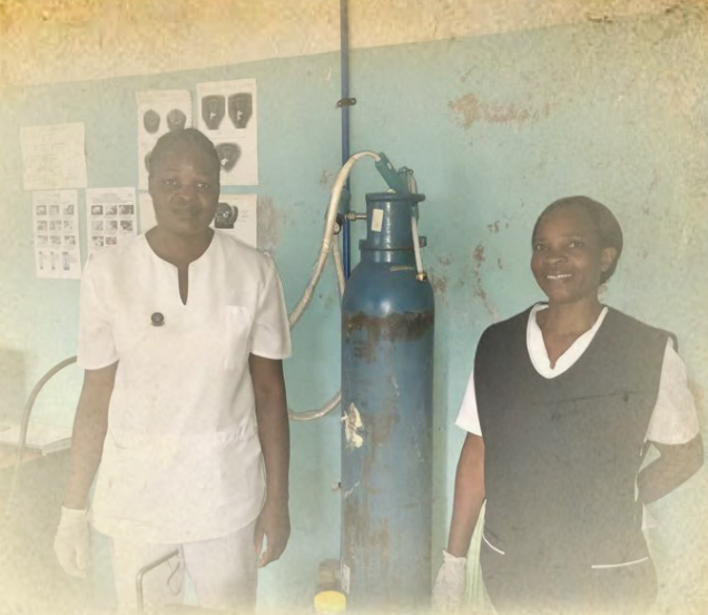
Zambia, Cervical Cancer Prevention

This national camp hosts assemblies as well as Christian education events such as workshops, retreats and summer camps. The funds received will be used to purchase new equipment and furniture, repair leaks in the walls and ceilings of the buildings and allow improvements in the services offered by the camp.