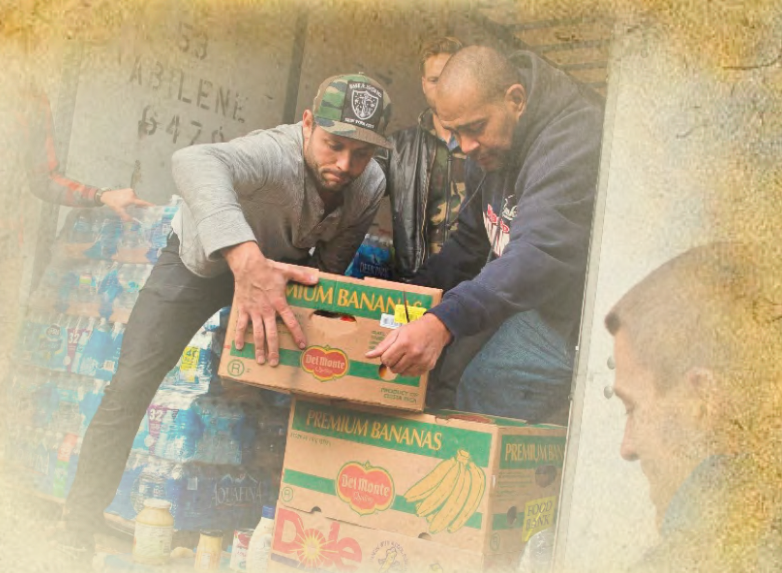
Loving Food Resources, Food Pantry Renovation