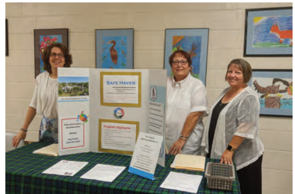
More than 40 volunteers lend their teaching expertise or offer support to children and caregivers.