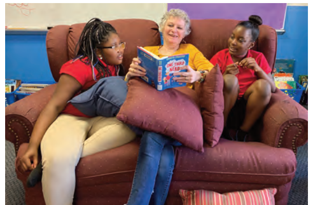
Reading with tutors has cultivated a love of books for many Safe Haven students.