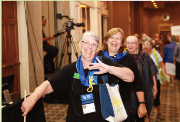
More than 1,600 women attended PW's 2018 Churchwide Gathering in Louisville; thousands more joined in spirit!