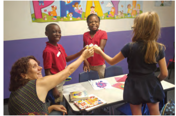
Students who come to Safe Haven for tutoring also have time to explore the arts.