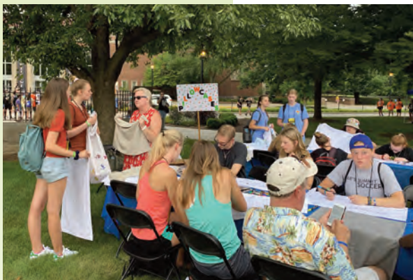
Together in Service for Puerto Rico took root, allowing PWs everywhere to support Puerto Rico's recovery work financially and with pillowcases for the children.