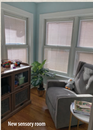
New sensory room

No matter how you choose to give to Presbyterian Women, your support of PW’s annual fund sustains PW’s work “for the good of all” (Gal. 6:10b), locally, nationally and globally.