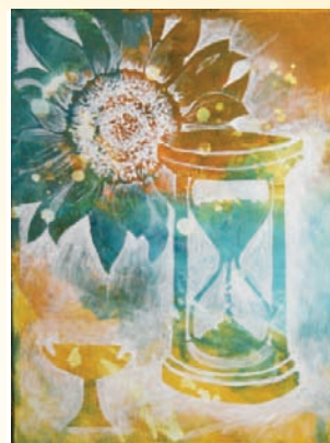
LESSON FIVE Lamenting Life