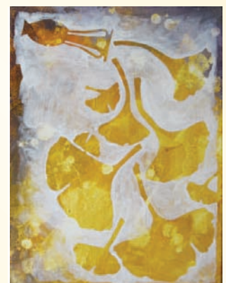
LESSON NINE The End of Lament