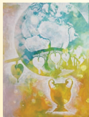
LESSON SEVEN Creation Laments