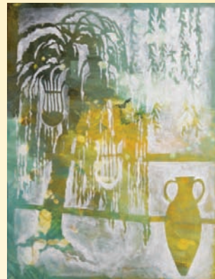
LESSON TWO Lamenting Together