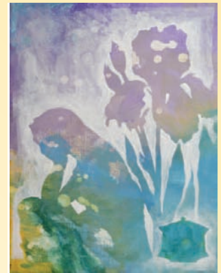
LESSON THREE Women's Lament