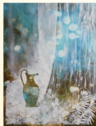
LESSON EIGHT God Laments