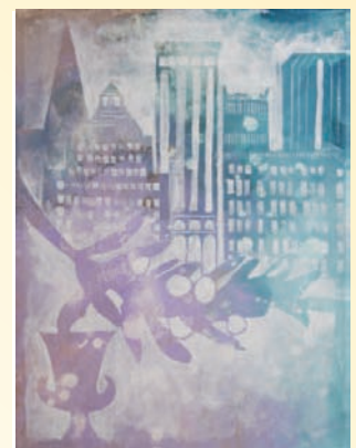
LESSON SIX Lament Over the City