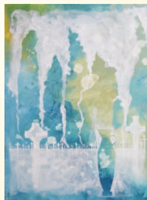
LESSON FOUR Lamenting Death