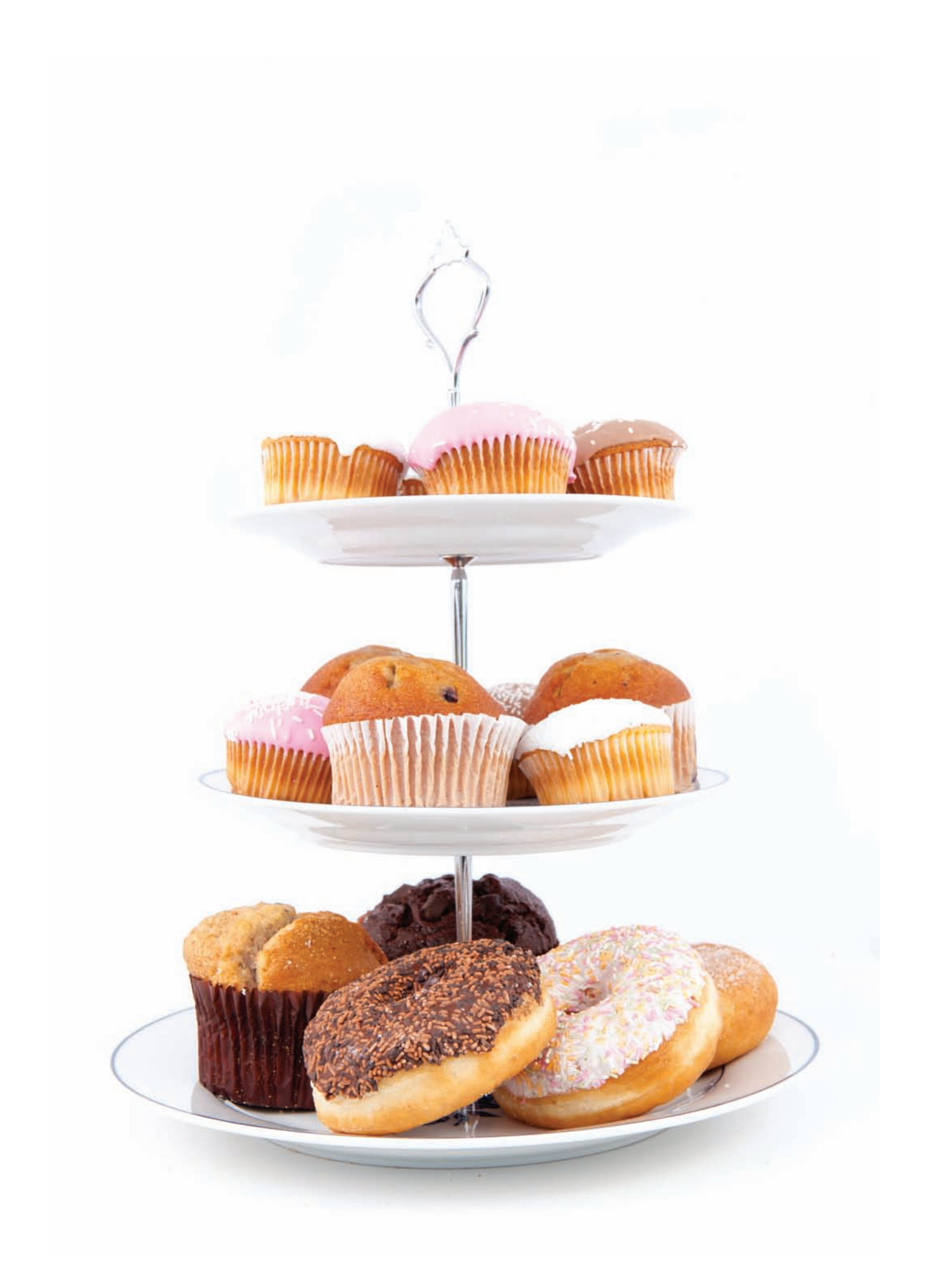
Presbyterian Women? Aren't they the ladies in the kitchen after church?