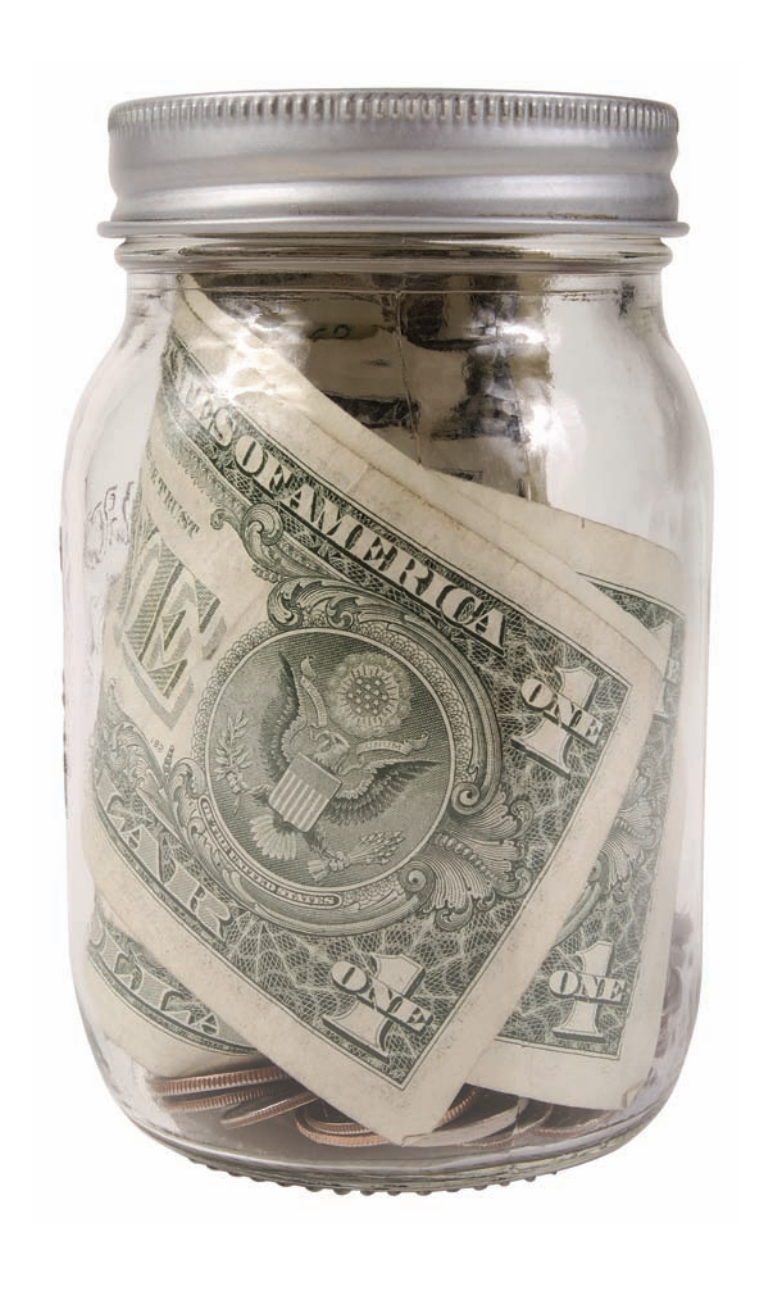
Presbyterian Women? Don't they raise money for mission?