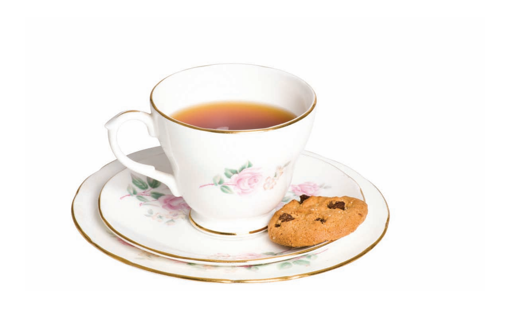
Presbyterian Women? Bible study, tea and cookies, right?