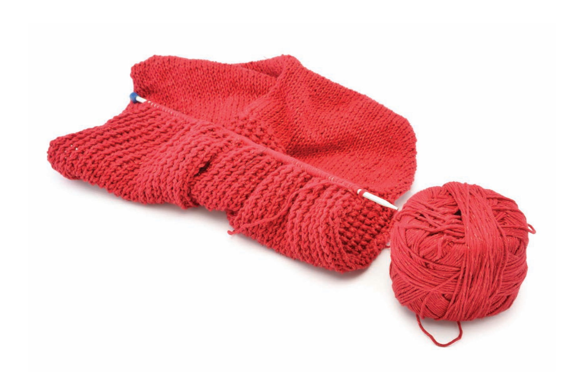
Presbyterian Women? Don't they knit baby blankets and roll bandages?