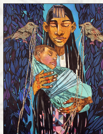
LESSON EIGHT Mary in the Faith and Tradition of the Church