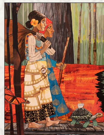
LESSON FOUR Ruth and Loyal Love

*Note that prices do not include shipping and handling ($6.25 minimum). International orders and orders to Puerto Rico incur additional shipping charges. Prices, availability, and shipping charges are subject to change without notice.