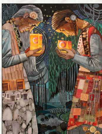
LESSON NINE What Are These Women Doing in a Place Like This?