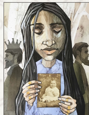
LESSON SIX Bathsheba