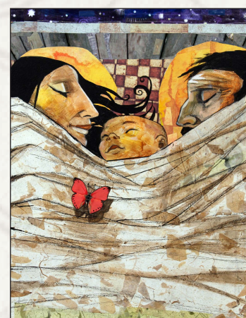
LESSON SEVEN Mary