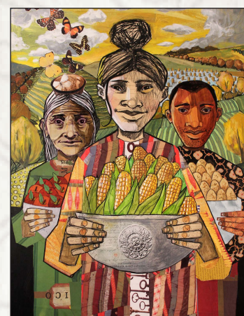
LESSON FIVE Ruth and Redemption