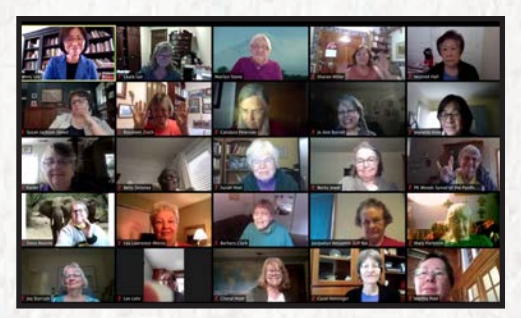
PW Town Square Zoom Meeting, May 2020