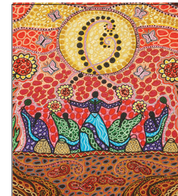
LESSON NINE Sabbath and Community