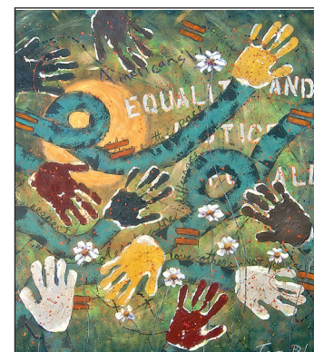
LESSON EIGHT Sabbath and Justice