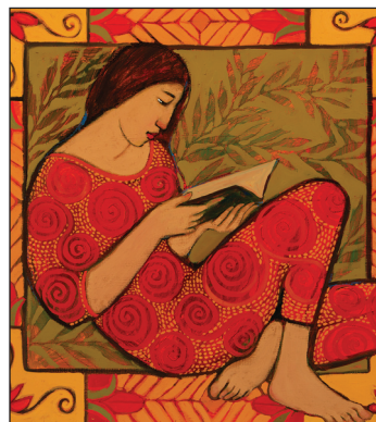
LESSON FIVE Sabbath and Servitude