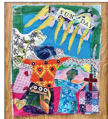
LESSON THREE Sabbath and Sunday