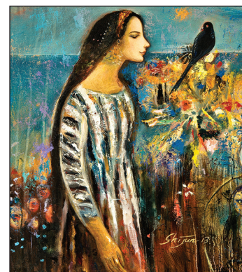
LESSON SEVEN Sabbath and Self-Care