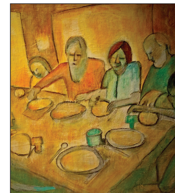
LESSON SIX Sabbath and Hospitality