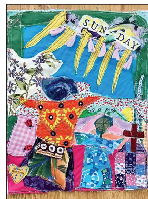
LESSON THREE Sabbath and Sunday