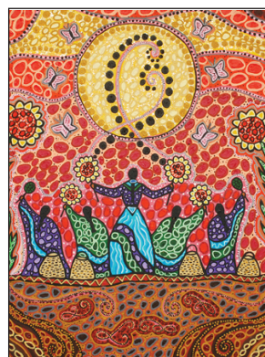
LESSON NINE Sabbath and Community