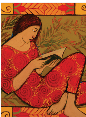
LESSON FIVE Sabbath and Servitude