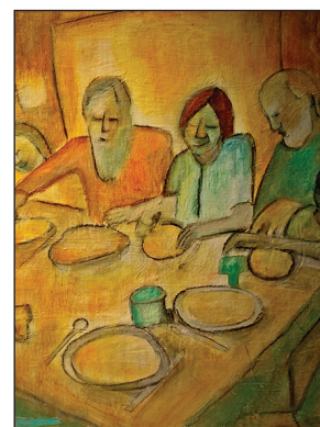
LESSON SIX Sabbath and Hospitality