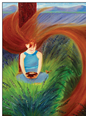
LESSON TWO Sabbath and Creation