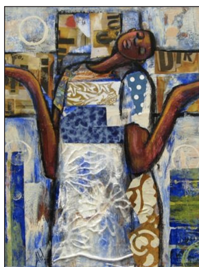
LESSON FOUR Sabbath and Surrender