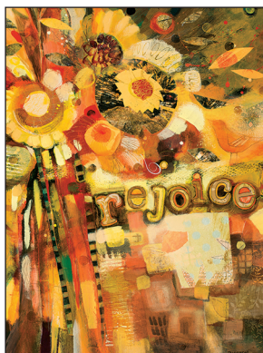
LESSON ONE Sabbath and Celebration

*Note that prices do not include shipping and handling ($6.25 minimum). International orders and orders to Puerto Rico incur additional shipping charges. Prices, availability, and shipping charges are subject to change without notice.