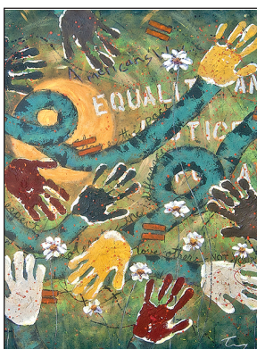
LESSON EIGHT Sabbath and Justice