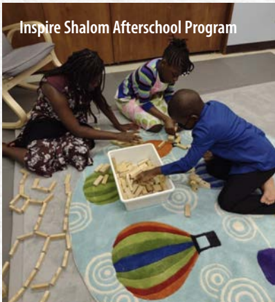
Inspire Shalom Afterschool Program

In 2021, Presbyterian Women, through our historic Birthday Offering, granted $77,061 to Memorial Drive Ministries (MDM) in Stone Mountain, Georgia. More than 50,000 refugees have been welcomed to the Stone Mountain–Clarkson area, dubbed the most diverse square mile in North America. MDM is a church-based nonprofit that ministers to their changing community by providing a welcoming environment for programs that need space to thrive and grow. PW's grant provided necessary capital improvements to the MDM gymnasium. Now, two of the many collaborations and community organizations that use the gym are the Paideia School's Ultimate Frisbee Team and Inspire Shalom afterschool program. Our financial gift will bless, year after year, in beautiful ways that we cannot know today. "Now faith is the assurance of things hoped for, the conviction of things not seen" (Heb. 11:1). Indeed.