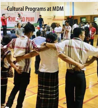
Cultural Programs at MDM

"The Paideia School's Ultimate Frisbee Team utilizes the gym for team practices and coaching students from the Inspire Shalom afterschool program, which serves resettled refugee middle-schoolers. In 2017, the new partners were looking for a regular practice space that would not be affected by weather, but it has become so much more. The space allows sharing a love for ultimate frisbee but also for building incredible friendships. Athletes look forward to the time in the gym for competitive and fun practices. Girls love coaching and making lasting relationships with the students of Inspire, gaining valuable experience as leaders, coaches and near-peer mentors. They are so grateful to have a gym like this nearby so this magic can happen every Wednesday, January to June. Thank you for investing in our campus and our community!"