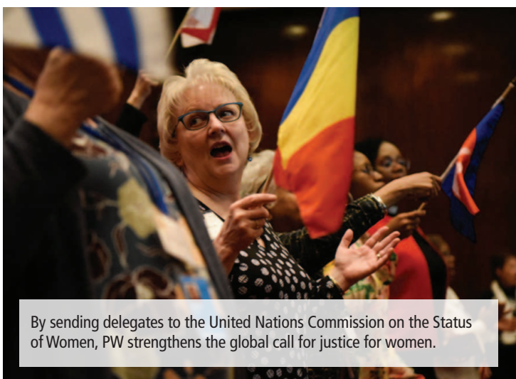
By sending delegates to the United Nations Commission on the Status of Women, PW strengthens the global call for justice for women.

Presbyterian Women has sown many mustard seeds throughout the years, even over generations. And from these tiny seeds, cast in love, have sprung mighty ministries and programs that provide refuge and replenishment. Some of the seeds have blossomed into well-known and respected denominational ministries, including the Presbyterian Hunger and Peacemaking Programs as well as the Mission Yearbook of Prayer & Study . Some have blossomed into fully functioning hospitals and clinics, and many march on, aiding orphaned children and championing women's concerns through PW's NGO at the United Nations as well as through ecumenical partnerships such as the Fellowship of the Least Coin. Presbyterian Women's grant programs, including PW's Birthday Offering, in its 101st year, and Thank Offering, in its 134th year, have generously bestowed more than $63 million to make real God's realm for so many of God's beloved people. Presbyterian Women's faithful and strong networks provide a way for each of us to participate; together, our impact provides real hope for real people.