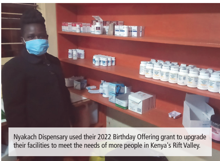
Nyakach Dispensary used their 2022 Birthday Offering grant to upgrade their facilities to meet the needs of more people in Kenya's Rift Valley.

Sometimes a little seed money can make a big difference. For 8,000 people living on the western edge of Kenya's Rift Valley who rely on the Nyakach Dispensary for health care, a $50,000 Thank Offering grant provided sufficiently to meet the clinic's most critical needs. Nyakach, built in 1906, received much-needed structural and grounds upgrades—a new laboratory and office equipment, new patient furnishings and facilities, improvements to the kitchen, garden, and laundry—as well as two motorbikes for making house calls! Following PW's initial investment, a donation of more fenced land helped additional expansion. Kenya's government also provided staff, as well as a youth and children's department and programs. The government paved the formerly dirt road leading to the dispensary. These upgrades mean better management of diseases, including best-management practices on tuberculosis, malaria and others. Nyakach is now recognized as a Level B Health Center by Kenya's government and can now accept hospital insurance plans.