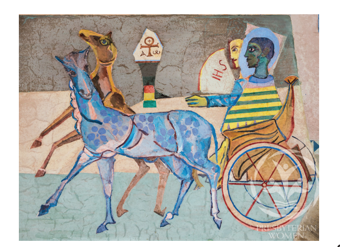
Philip and the Ethiopian Eunuch, Herbert Boeckl

Main Idea: God calls us to affirm that each person is a child of God who should be treated with dignity and equity.