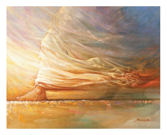
Touch of Faith, Yongsung Kim

Main Idea: Jesus' presence and human vulnerability can result in a personal and communal transformation.