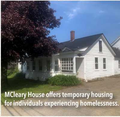
McCleary House offers temporary housing for individuals experiencing homelessness.