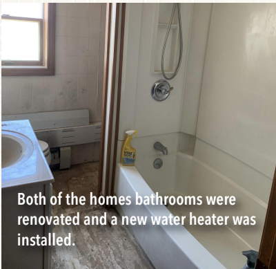
Both of the homes bathrooms were renovated and a new water heater was installed.