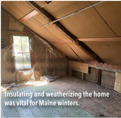
Insulating and weatherizing the home was vital for Maine winters.