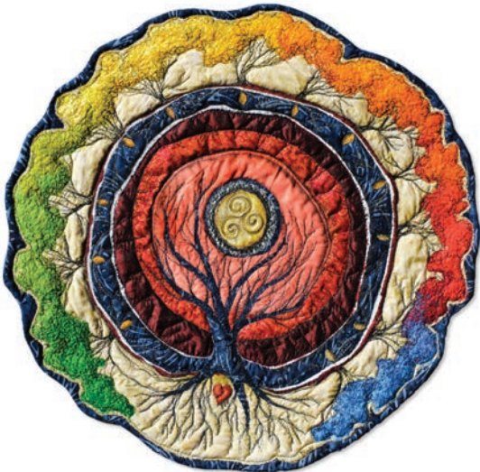
Into the Light, Lorraine Roy

Main Idea: Scripture and modern science help us see nature's wisdom more clearly and lead us to seek just ways to care for the earth and one another.