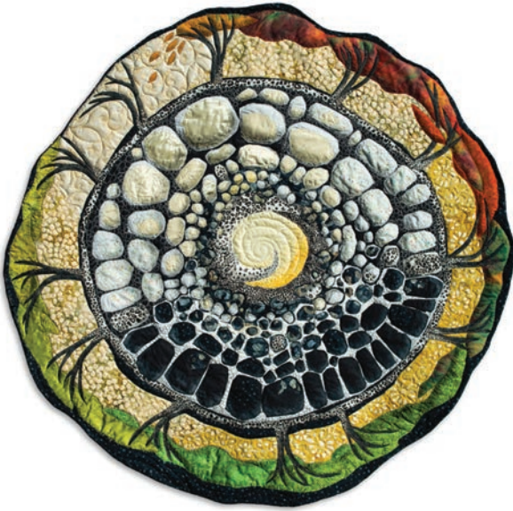
Seasons, Lorraine Roy

Main Idea: Scriptural accounts of divinely ordered conquest and laws of Jubilee that support the rights of individual landowners stand in tension but are rooted in the perception that all the earth is God's.