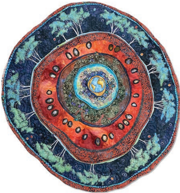
All the Words, Lorraine Roy

Main Idea: We protect the created world we share and need from environmental degradation and destruction.