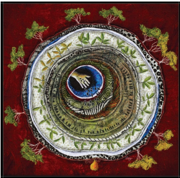
Missionary, Lorraine Roy

Main Idea: The Bible portrays the earth as yielding food in abundance, and today's agricultural scientists say it could provide food for all. We can learn to produce food with justice and peace and feed a starving world.