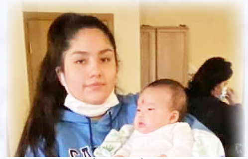
Dakota Presbytery Pine Ridge Indian Reservation Waniyetu Consulting Welcoming of the Child

Creative Ministries Offering Committee Presbyterian Women in the PC(USA), Inc.