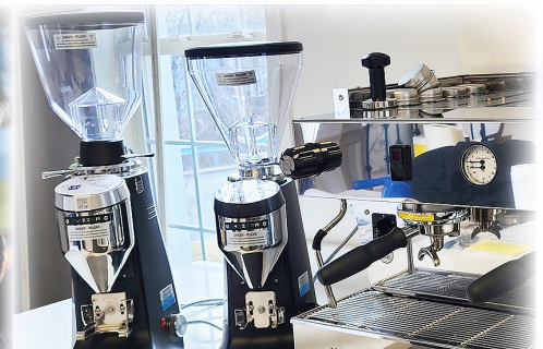
Presbytery of Carlisle Peace Promise Kitchen Renovation