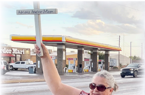
Office of the General Assembly of the PC(USA) Office of Immigration issues Public Affairs Software Platform for Grassroots Advocacy