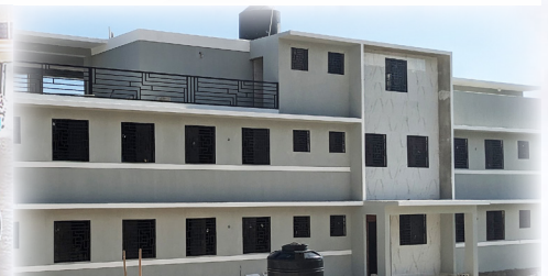
Haiti and Synod of Mid-America Heartland Presbytery Higgins Brothers Surgicenter for Hope Village Presbyterian Church, Prairie Village, Kansas, fiscal sponsor, Surgicenter Ambulance

Visit presbyterianwomen.org/thank to learn more, give online and download resources.