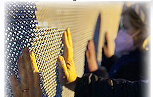
Presbytery of the James Voices of Jubilee Crossing Borders Accompaniment