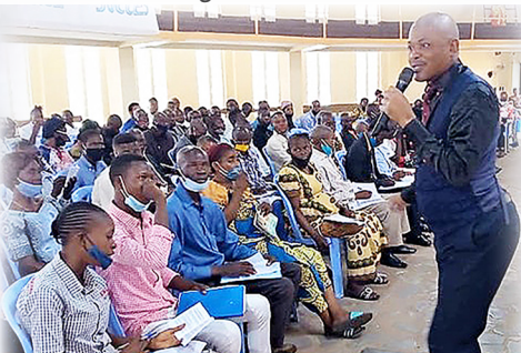
Democratic Republic of Congo Presbyterian Church in Congo (CGO) Presbyterian Ministries with Vulnerable Children Protecting Children in Greater Kasai