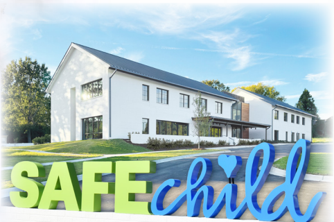
Presbytery of New Hope SAFEchild Technology at SAFEchild Advocacy Center