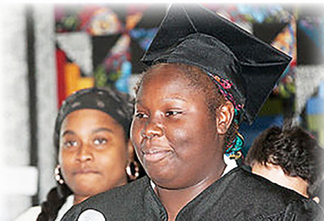
Central Florida Pesbytery Forward Paths Foundation, Inc. Homes to Independence —Housing for Homeless Youth