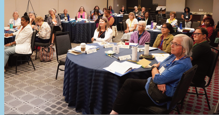
PW is an antiracist organization. A RED (Racial Equity Dialogue) rep training at the 2024 Churchwide Gathering