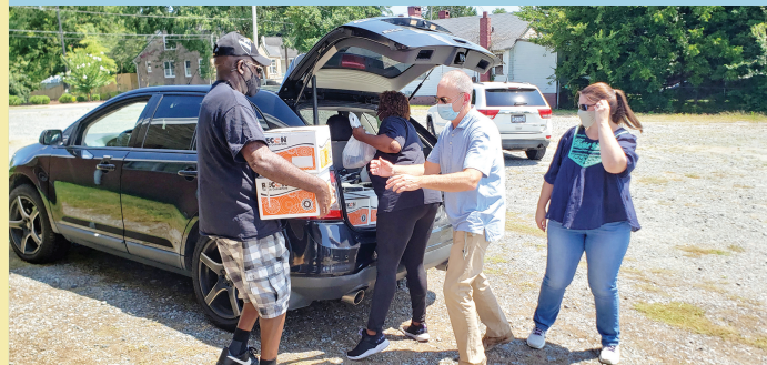
PW's hands-on mission builds relationships and answers needs.