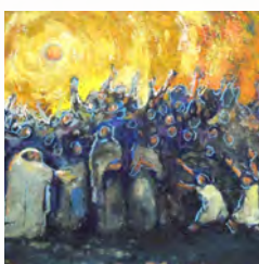
Lesson Four Living Freely and the Responsibility to Care