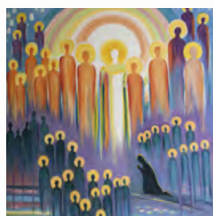
Lesson Six "Now You Are the Body of Christ"