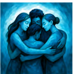
Lesson Seven Christian Love