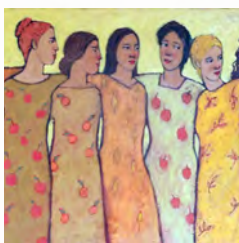
Lesson One Unity in Christ, Wisdom from God