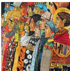
Lesson Two Connected in Christ