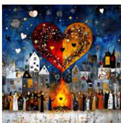
Lesson Five For the Good of the Community