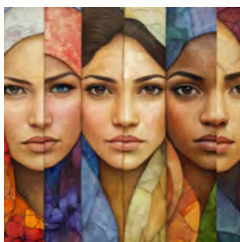
Lesson Nine Connected by God's Love