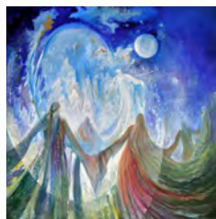
Lesson Three Freedom in Christ